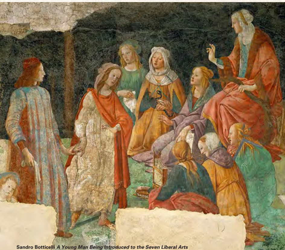
Sandro Botticelli A Young Man Being Introduced to the Seven Liberal Arts

Higher Education in an Age of Global Mobility